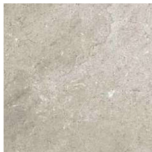
PI7 02 BROWN V3 60x60cm - matt 30x60cm - matt . structured