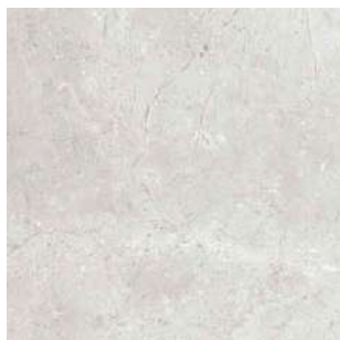
PI7 04 GREY V3 60x60cm - matt 30x60cm - matt . structured