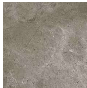
PI7 03 DARK BROWN V3 60x60cm - matt 30x60cm - matt . structured