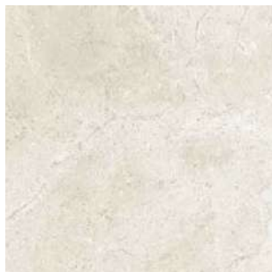
PI7 01 BEIGE V3 60x60cm - matt 30x60cm - matt . structured