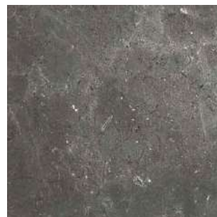
PI7 06 BLACK V3 60x60cm - matt 30x60cm - matt . structured

RANDOMNESS: 60x60cm – 9 faces 30x60cm – 12 faces